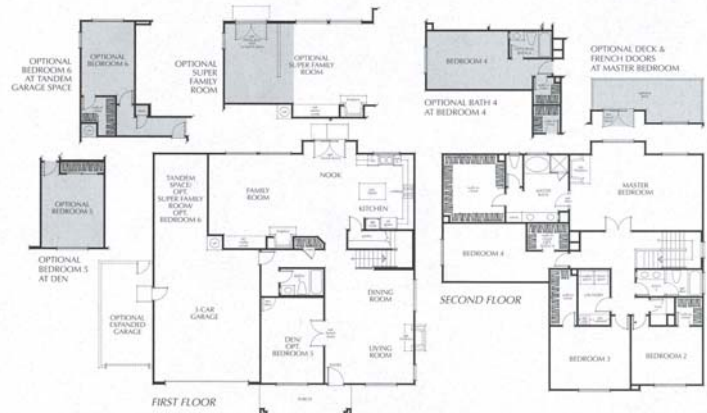
PLAN 3323 (REVERSE)

DON'T SETTLE FOR SECOND BEST...CALL ME FIRST